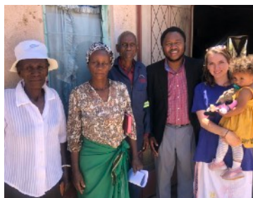
Meeting with the Village Head about the church.

We are inspired by the example of Paul and his coworkers as they went about establishing congregations in various areas. What humbles us and gives us direction in our efforts is the example he left. It is very clear Paul never claimed ownership of these churches nor did he seek glory and praise for his efforts. Instead what we see is Paul giving all glory to God, and we want emulate that same attitude as we plant churches for Christ!