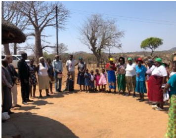
“Meet-and-greet” after the first Sunday service.

After the funeral the local community people asked if a church of Christ could be planted in this area as there was no church at all in this village. Ever since its inception over 20 people have been baptized already! We praise God for this. We currently meet on Sundays from 9am to 11am at one of the member’s home. We are so pleased to inform you that we already have a prospective piece of land where the church