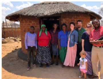
Meeting with the community members about the church.